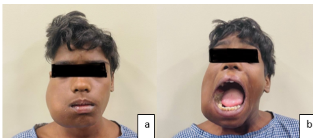
Figure 1: a,b: Showing the bony swelling on the right side of the face and its intraoral extent.

(Figure 2 a,b) 3.8 X 7 X 7.8 cm large expansile swelling involving body, ramus and coronoid process of right hemi mandible causing significant cortical thinning and focal discontinuity of outer and inner cortex of mandible.