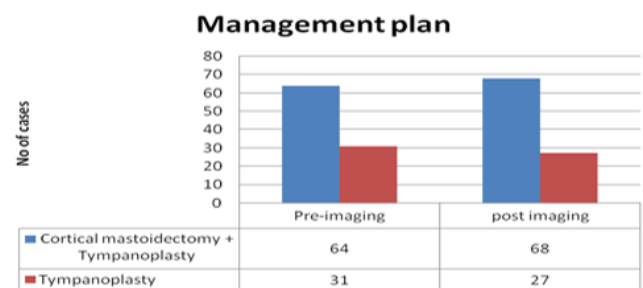
Fig. 1: Comparative bar chart of two types of surgeries performed in the study population

Details of management plan before CBCT were compared with the plan after CBCT. The percentage of cases undergoing a change in the management after CBCT was determined. The nature of change in the management plan was also noted. The correlation of CBCT findings and intra operative findings in terms of specificity and sensitivity was statistically calculated using Mc Nemar's test.