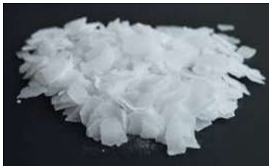
Fig. 1: Solid Caustic crystals

20 year old adult male reported to the Emergency department with accidental ingestion of caustic soda crystals (as in Fig. 1) (as a part of “prank” or “perplexed” it to be ‘rock sugar’ (as in Fig. 2).