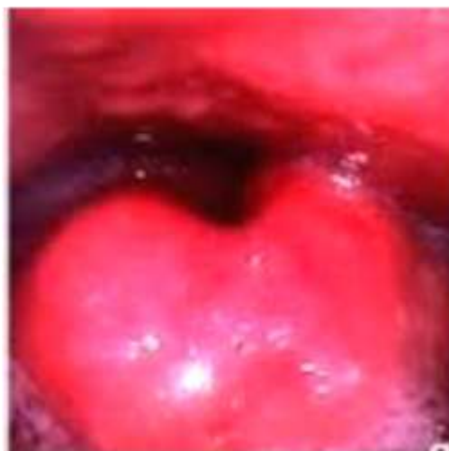
Fig. 3: Ballooned up appearance of epiglottis with laryngeal edema and vocal cords not visualised.

On Video-laryngoscopic examination (as in Fig. 3): Laryngeal edema and congestion (“Ballooned up appearance”) of epiglottis with excessive pooling of secretions. B/L Vocal cords and subglottis view were obscured.