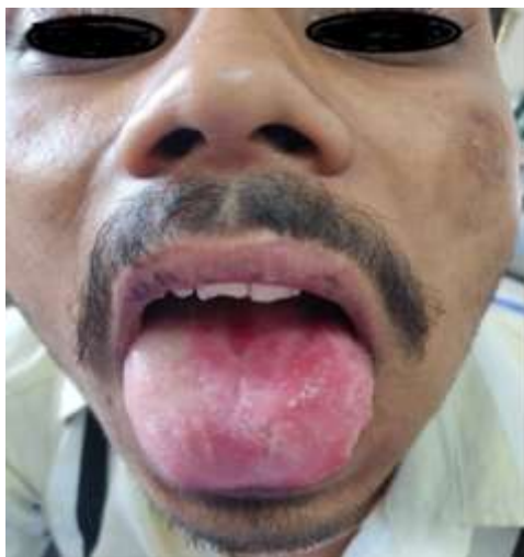
Fig. 7: Erythema seen over tongue.

Day 2: Throat/ Larynx examination: Erythema over tongue, buccal mucosa, palate comes to normal (as in Fig. 7). Edema over epiglottis drastically reduced with slough seen (as in Fig. 8). Congestion over arytenoids reduced. Vocal cords normal and mobile (as in Fig. 9) while subglottis well visualised (as in Fig. 10).