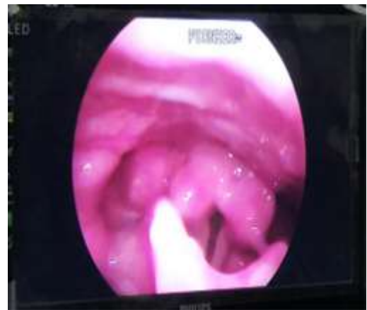
Fig. 9: Vocal cords normal and mobile.