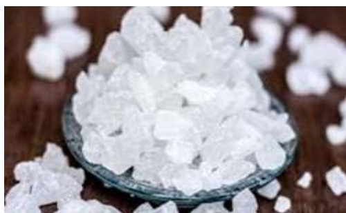
Fig. 2: Hard Rock sugar crystals

He gives history of respiratory distress, dysphagia, burning sensation in the oral cavity and pain in the throat. He also complains of vomiting with no blood contents in it. He is a vegetable cutter at our hospital mess and a chronic alcoholic.