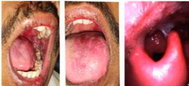
Fig. 4,6,7: Showing signs of inflammation in the oral cavity and larynx.

Day 1: Oral cavity /oropharynx: Edema and congestion subsided (as in Fig. 4). Burns reduced over tip of tongue, buccal mucosa, hard and soft palate (as in Fig. 5). On VDL examination: Edema over the epiglottis subsided (as in Fig. 6) with congested arytenoids (as in Figure 6) with rest of the larynx barely visualised.