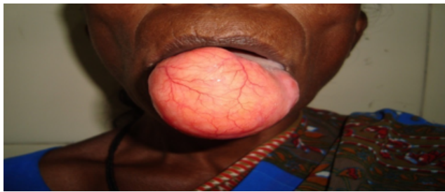
Fig. 3: Large lipoma of tongue