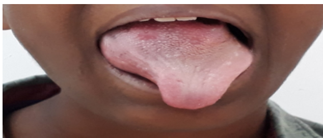
Fig. 4: Hemangioma of tongue

12 cases of hemangioma were seen. Tongue was the most common site followed by lower lip, buccal mucosa and alveolar ridge. Males and females were equally encountered in our study. On examination they appeared as dark red to purple, soft and sessile mass with smooth surface. 4 cases were seen in children. MRI was done for large lesions on tongue. Small lesions were treated by wide excision under local anaesthesia and large sized were treated using General anaesthesia. One case of large hemangioma of base of tongue was treated by sclerotherapy.