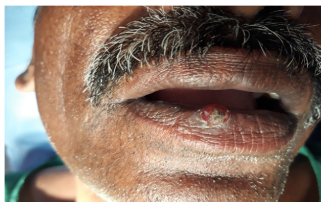
Fig. 1: Pyogenic granuloma of lower lip

Mucous retention cyst was found in 18 cases. Females were encountered more than males. Buccal mucosa was the commonest site followed by mucosal surface of lower lip and floor of mouth. Most common complaint was excessive salivation. On examination they appeared as pinkish nodular swelling with smooth surface.