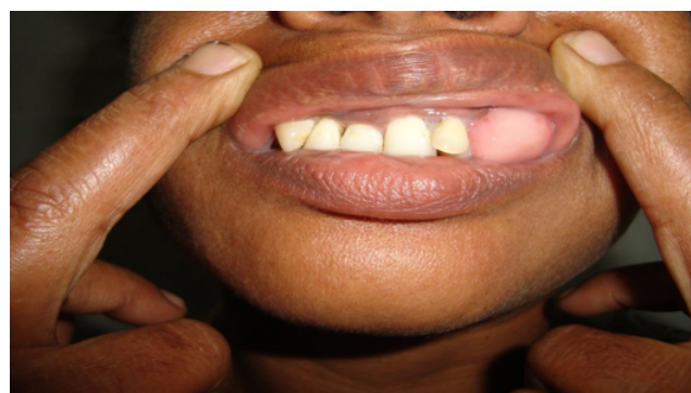
Fig. 2: Epulis Benign Tumours.

Fibrous epulis was seen in 4 cases. 3 cases were seen in female patients and all cases were seen on gingiva. History of denture usage was present in all cases and on gross examination all cases presented as painless fleshy nodules.