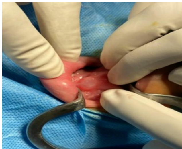
Fig. 1: Cystic swelling on the floor of the mouth