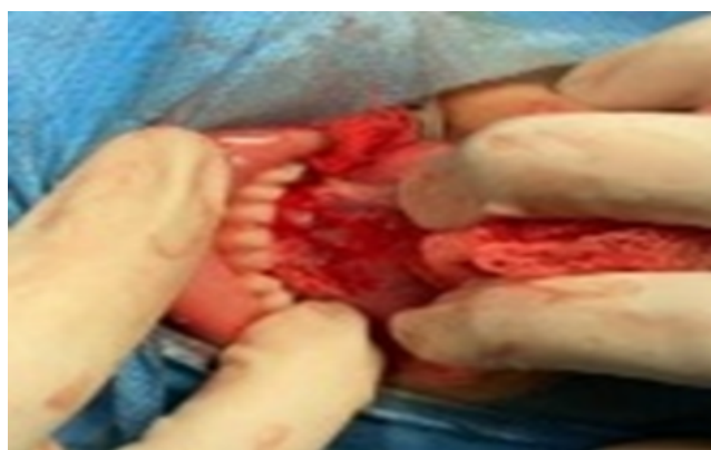
Fig. 2: Post excision of swelling, fibrous tissue adhesion, and frenectomy